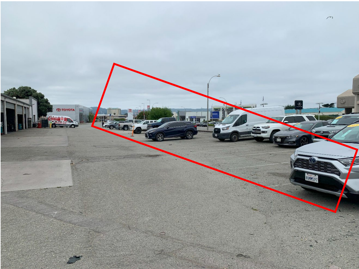
Area of proposed tandem parking. North end, facing south.