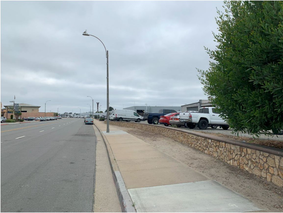
Parking area adjacent to Del Monte Boulevard. No new vehicle entrances included in project.