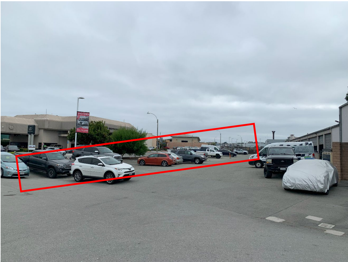
Area of proposed tandem parking. South end, facing north.